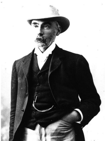
Figure 3: Charles Yelverton O'Connor, ca.1897.