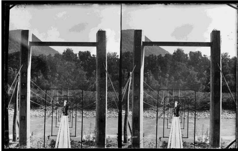
Figure 2: Wire Suspension Bridge over Taipo River. Taipo River, wire bridge

The Taipo River remained a dangerous hurdle for travelers to and from the West Coast, along with the poor state of the road. In May 1876 drovers and the Provincial Engineer agreed that “[a] bridge across the Taipo is very much wanted.” 22 In April 1877 the Westland County Council included the construction of a new bridge over the Taipo in their estimate for new works and, on the motion of Cr. Richard Seddon, resolved to call tenders for the same. 23 However in June the Resident Engineer Charles Yelverton O’Connor (1842-1902) reported that it would be necessary to bridge the whole span of the river, rather than just the site of the existing suspension bridge, and probably to move the road as well. 24 This would cost £3000-£3500 against a budget of £1400 and the Council decided “to take no action in the matter of a bridge for the present.” 25