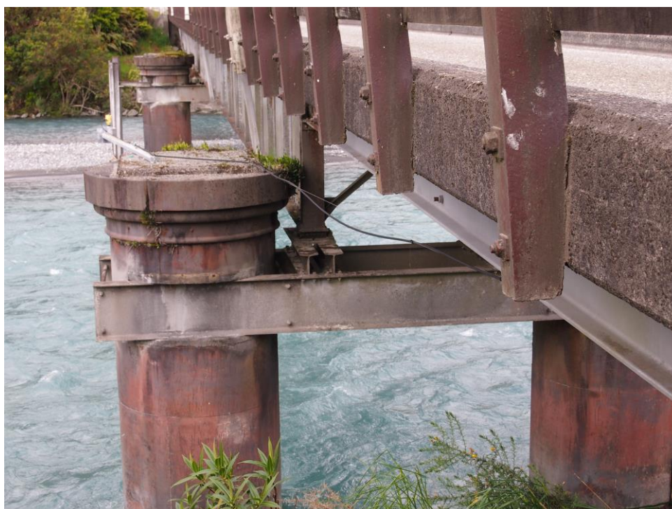
Figure 4: Taipo River Bridge, November 2014.

The existing Taipo River bridge is a single-lane steel plate girder bridge that rests on four of the original eight concrete cylinder piers. Geoffrey Thornton, engineering historian, describes this as ‘a most unusual arrangement.’ 85 The bridge is still used by road traffic on State Highway 73, meaning that it continues to form a critical link for travel to and from the West Coast. 86