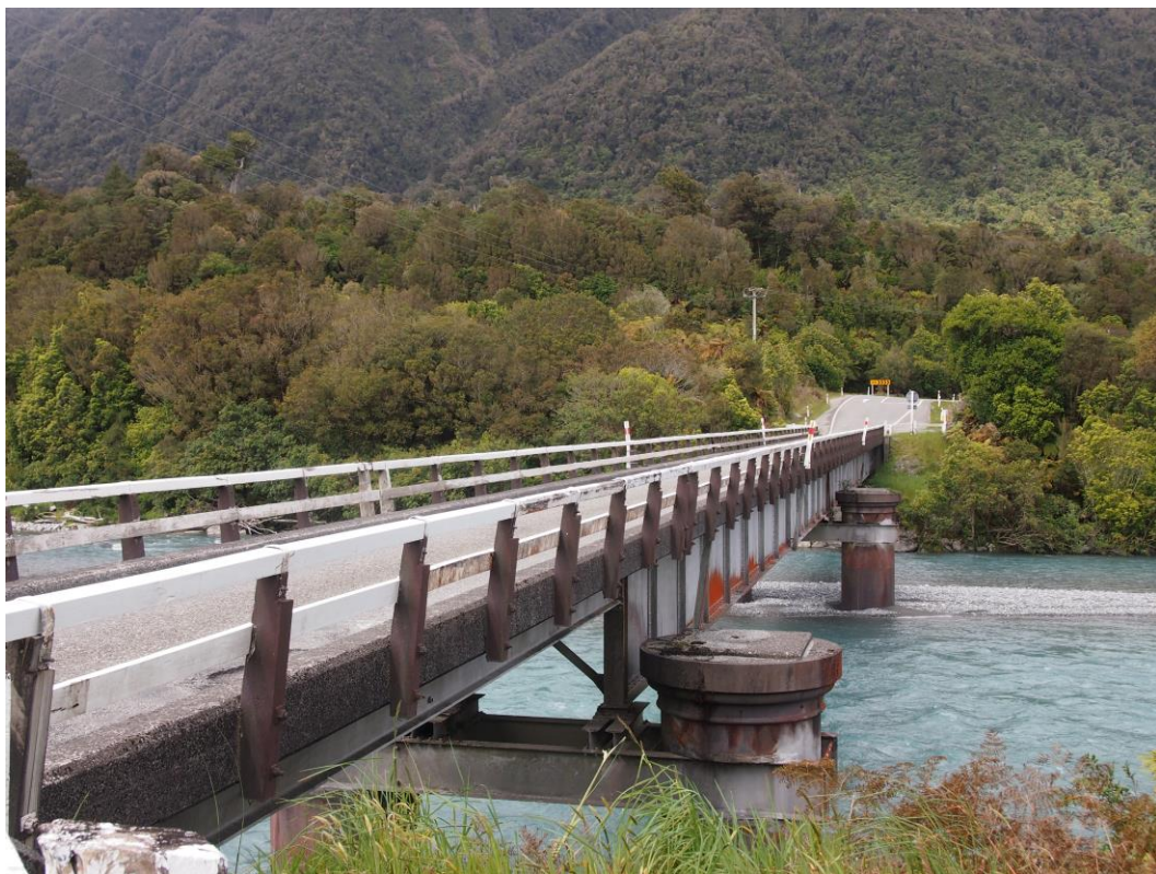
The Taipo River Bridge. November 2014. IPENZ.