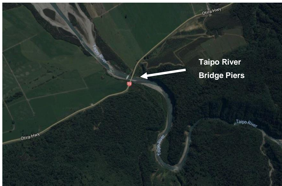
Location map

Access information: The piers are structural elements in the existing Taipo River single-lane bridge on State Highway 73 (Otira Highway). They can be viewed from the roadside and from the river bank.