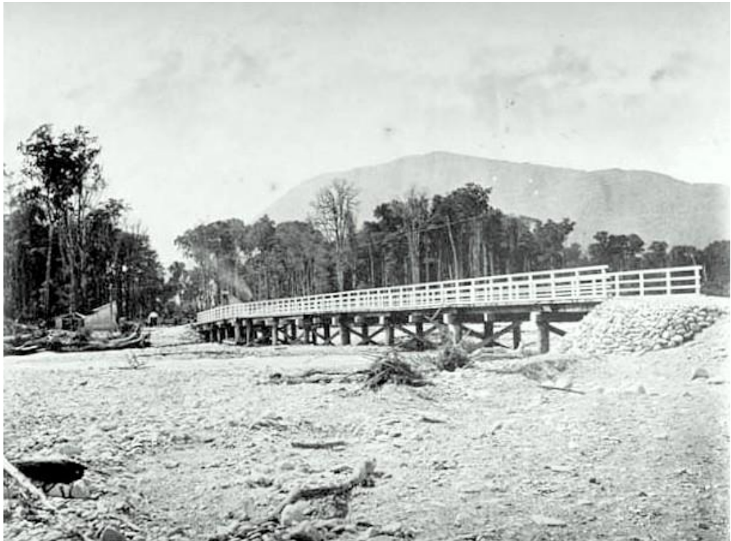
Figure 1: First Bridge over the Taipo River, March 1868. Auckland War Memorial Museum (AM), PH-ALB-86.

The plan to divert the river back under this bridge did not succeed. Efforts were described as an “endeavor for more than two years, at the cost of the County, to divert the river under the bridge, where at times a considerable number of men, horses, and drays were employed, all to no purpose.” 11 The Taipo River continued to represent an inconvenience and danger for travellers. In October 1866 it was reported that floods had caused the second stream to become “as full as the main stream, thus rendering the passage difficult.” 12