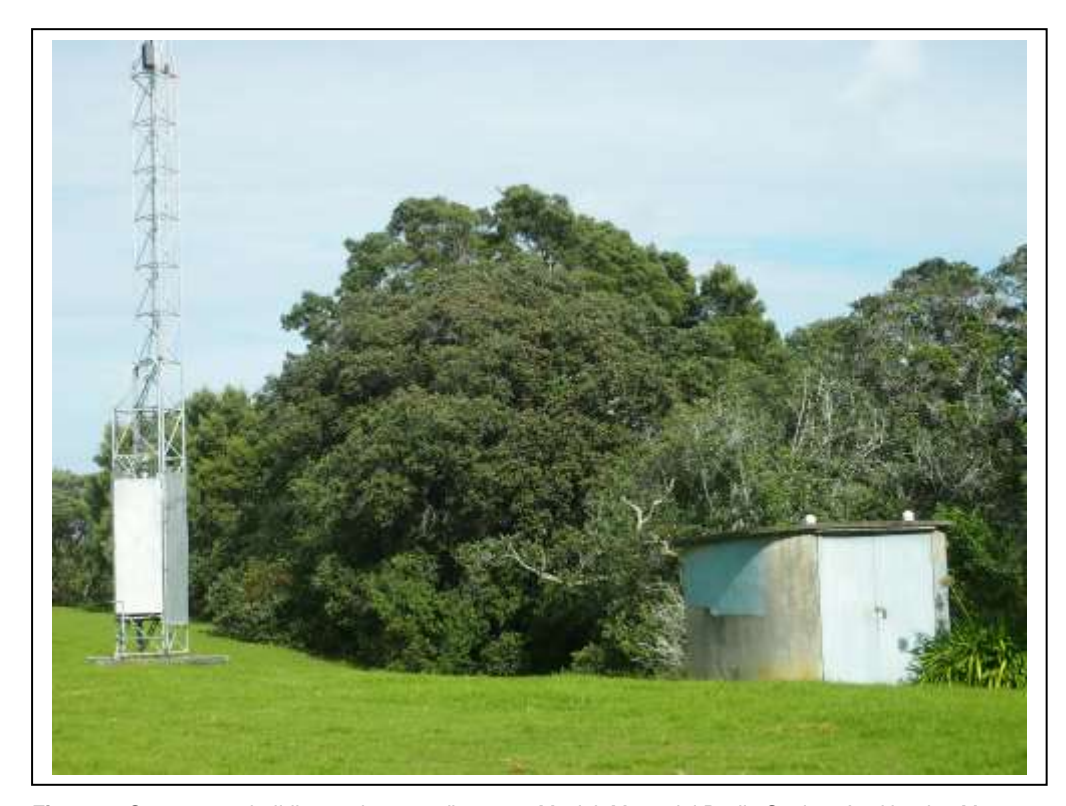
Figure 6: Concrete outbuilding and west radio tower, Musick Memorial Radio Station, Auckland, 5 May 2015.

A gabled temporary building to the west of Station became the gardener's shed, but was originally where ZLD services were operated between 1941 and the commissioning of the Station in 1942.91 In the late 1980s this was removed and replaced with a galvanised steel kitset garage building. An original or early small concrete building remains close to the garage and the west tower. 92