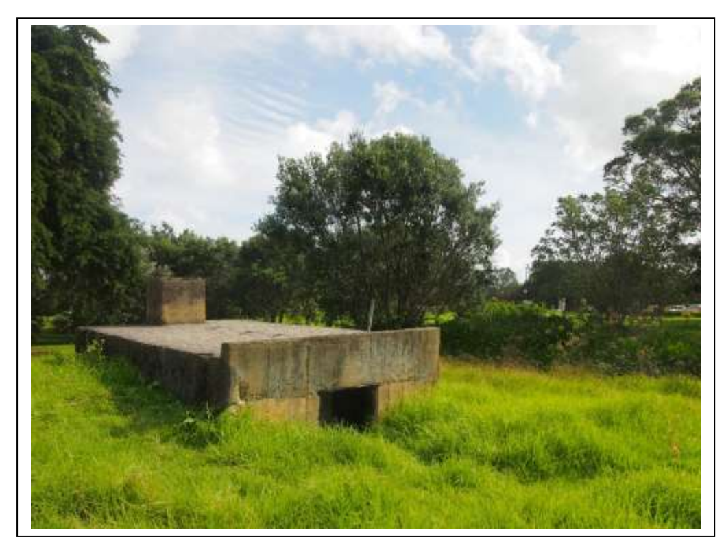
Figure 4: Air raid bunker at Musick Memorial Radio Station, Auckland, 5 May 2015.

Reflective of the construction era and the Station's military importance, a concrete air raid bunker was constructed about 200 metres from the Station building.88 This is located east of the driveway, close to the Station's boundary with Howick Golf Course.