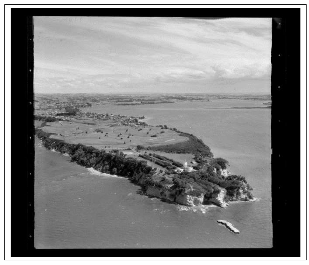
Figure 1: Musick Point, Pakuranga, Auckland [14 January 1965].

esteem East Tamaki Head was renamed in his honour in mid-1940 and a memorial radio station built on the site. 16 Even before his death the site was being considered for New Zealand's first international, ultra-modern, radio communications station. The headland location was chosen because it was sufficiently removed from electrical interference and because of its proximity to the Mechanics Bay flying boat base. 17 Approximately 50 hectares of the headland was set aside by the Crown for the radio complex, as well as another eight hectares for a transmitting station five kilometres away on Oliver Road.18