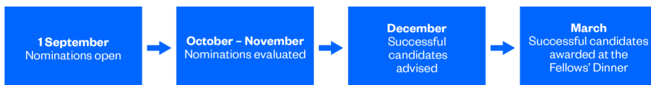
Figure 2: Decision-making process