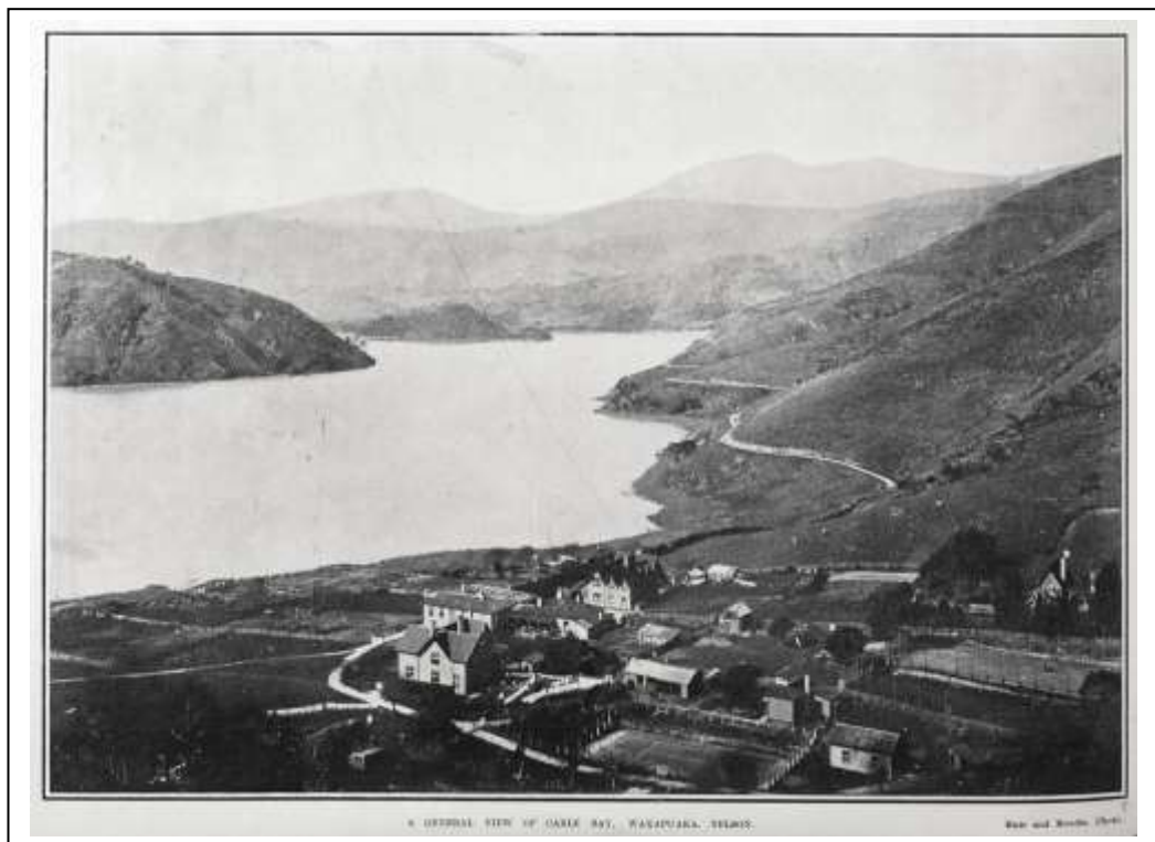
Figure 1: A general view of Cable Bay, Wakapuaka, Nelson, 2 February 1905.

Initially the Whakapuaka cable station was accessed by a reasonably primitive track and consisted of separate huts for the two Eastern Extension staff and three New Zealand Telegraph Department employees. By 1901 Cable Bay Road had been created and the station was staffed by 30 people, including New Zealand Press Association employees. 26