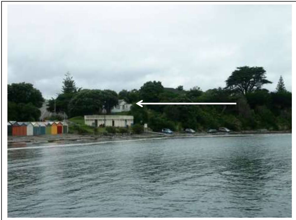
Figure 6: Titahi Bay, showing Trans-Tasman Telegraph Cable landing site and Cable Hut, 19 March 2014.

However, the original form of the building can be perceived behind these extensions. The stuccoed exterior and current roofing tiles probably date to post-Eastern Extension ownership. 85 The building is currently (2014) not in use.