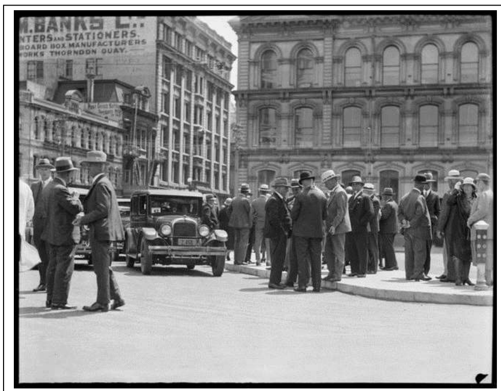
Figure 3: Men, possibly unemployed, and others in Post Office Square, Wellington [15 January 1933]. Negatives of the Evening Post newspaper. Ref: 1/2-084812-G. Alexander Turnbull Library, Wellington, New Zealand. http://natlib.govt.nz/records/22916627 . Permission of the Alexander Turnbull Library, Wellington, New Zealand, must be obtained before any re-use of this image.

January so that the relocation could be as efficient as possible. 37 Transferring the terminal to Wellington was proclaimed as being of “the utmost importance to the people of New Zealand” because for the first time the capital city was in direct contact with Australia. 38 On 23 August 1917 the company officially closed its Whakapuaka office, opening the Wellington one the same day. 39