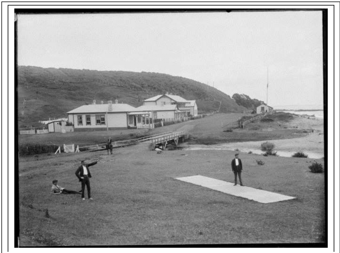
Scene at Cable Bay showing Cable Station and residences for cable staff [circa 1912]. Northwood brothers :Photographs of Northland. Ref: 1/1-004928-G. Alexander Turnbull Library, Wellington, New Zealand. http://natlib.govt.nz/records/22683928 . Permission of the Alexander Turnbull Library, Wellington, New Zealand, must be obtained before any re-use of this image.

Written by: Karen Astwood Date: 14 July 2014