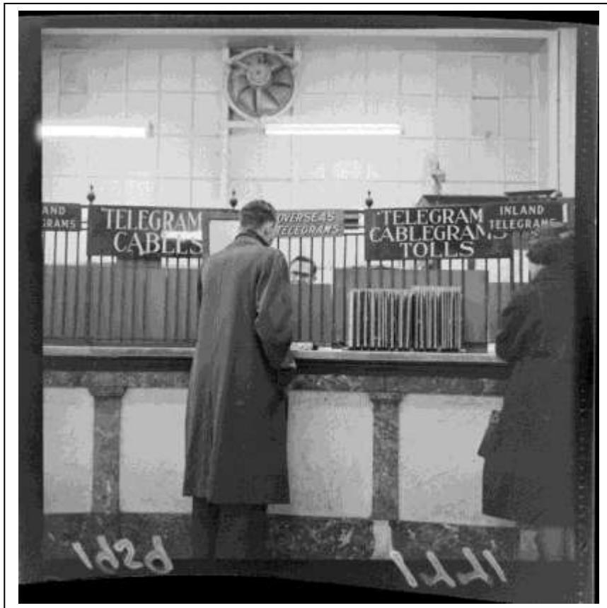
Figure 5: Telegram office, showing unidentified man standing at counter [1959]. Negatives of the Evening Post newspaper. Ref: EP/1959/1771-F. Alexander Turnbull Library, Wellington, New Zealand. http://natlib.govt.nz/records/23504060 . Permission of the Alexander Turnbull Library, Wellington, New Zealand, must be obtained before any re-use of this image.

In the late 19th and early 20th centuries telegrams were socially important, being the predominant means of conveying brief but significant personal information such as birth announcements or sending marriage congratulations. After the introduction of universal penny postage in 1901, New Zealanders sent over 13 million national and international letters. 69 Sending even one word by telegraph cost significantly more than these letters but could reach the other side of the world the same day, compared with taking around one month to reach England. 70 Therefore, despite penny post international telegraph use continued to increase. 71